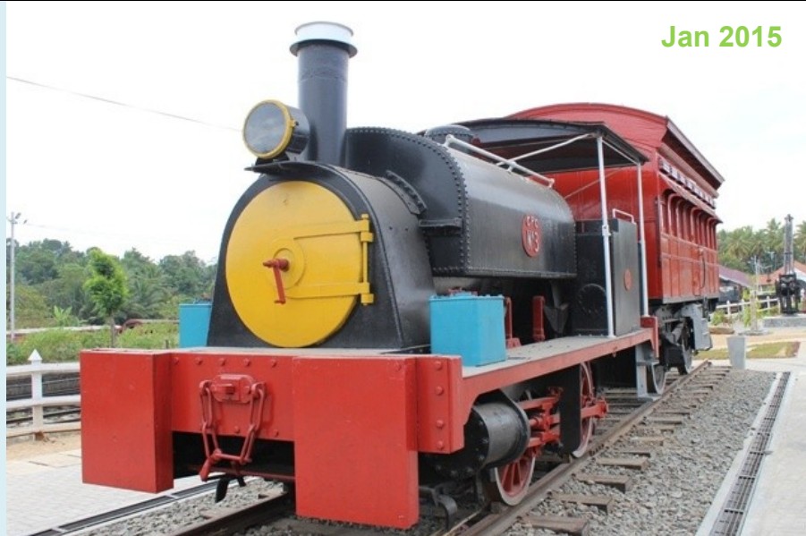
3 (2nd) 0-4-0ST 12 x 18 1937 Hunslet 1852 Rambukkana Converted to oil firing 1964. Plinthed near to the railway station